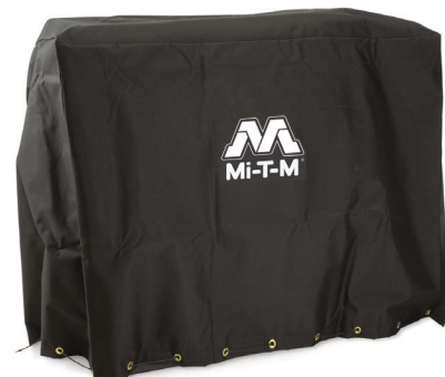
AW-6000-1006 Hot water skid equipment cover