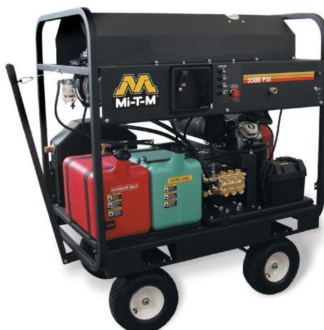
HVS-3506-1H6G shown with wheel kit option AW-5740-0000