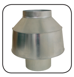
10-inch draft diverter included (21-inch height)